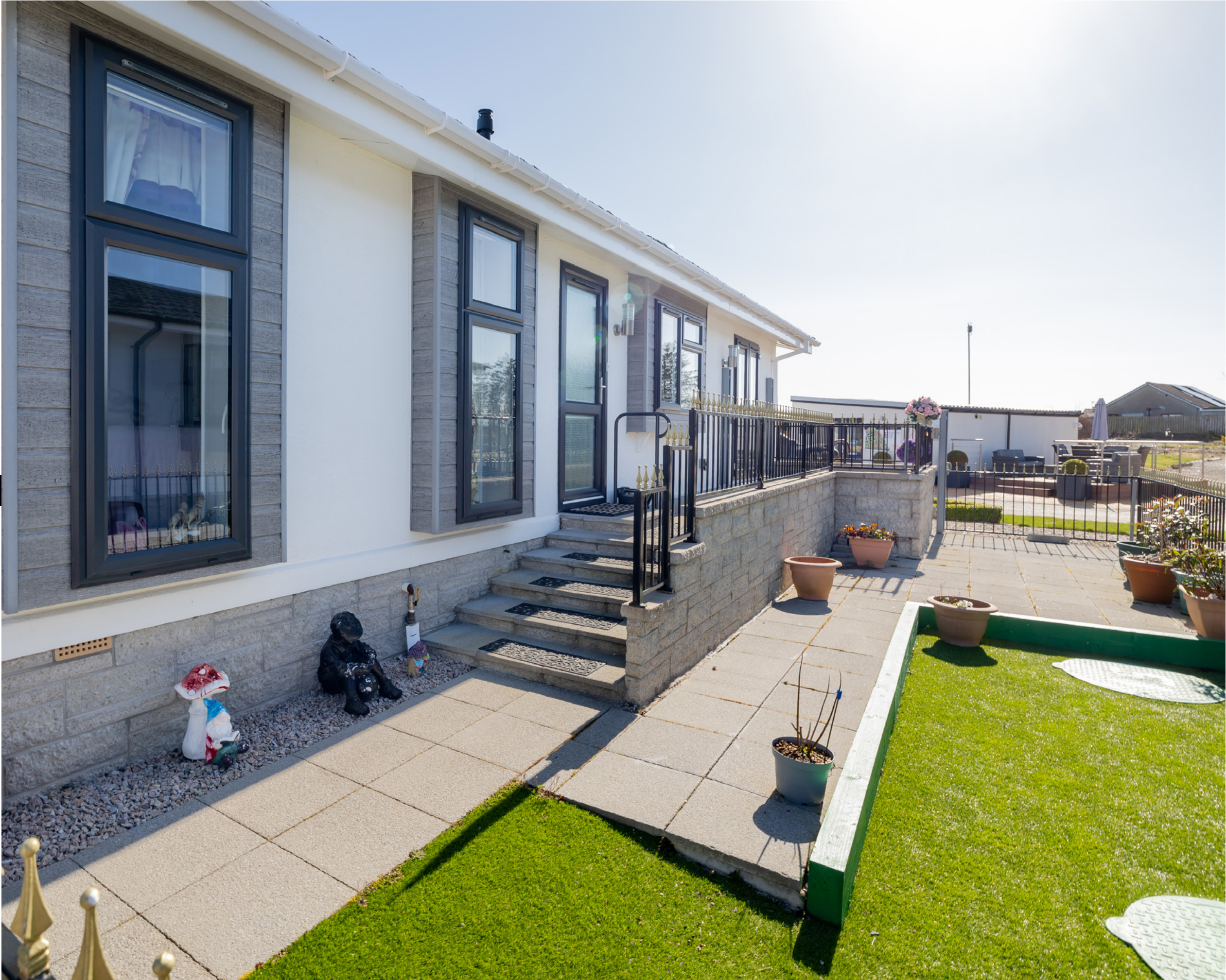
Outside there is off-road parking for one vehicle and a low-maintenance garden, perfect for al-fresco dining.