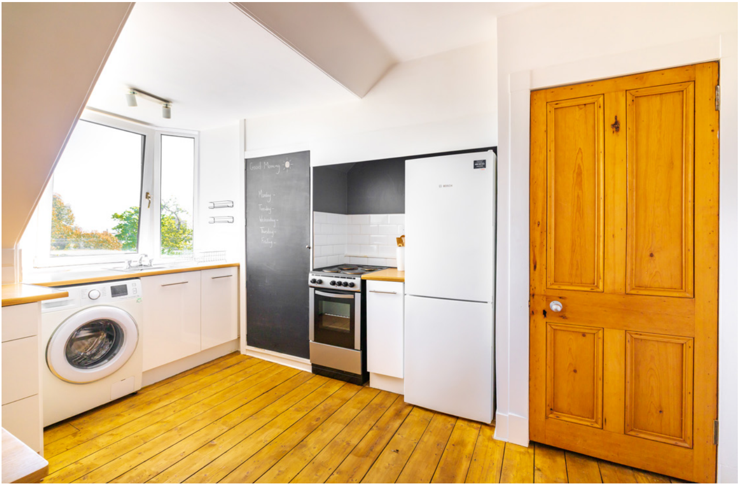
The kitchen is equipped with free-standing appliances and offers plenty of cupboard space, making it both functional and stylish.