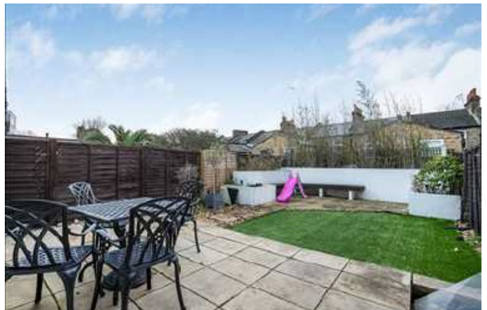
Joseph Hardcastle Close, SE14