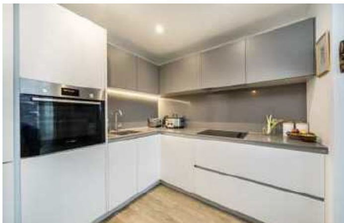
Goodwood Road, SE14