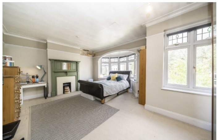
New Cross Road, SE14