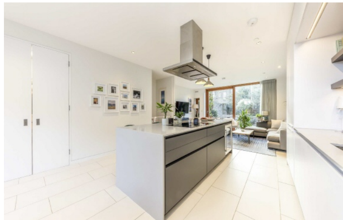
Hatcham Park Mews, SE14