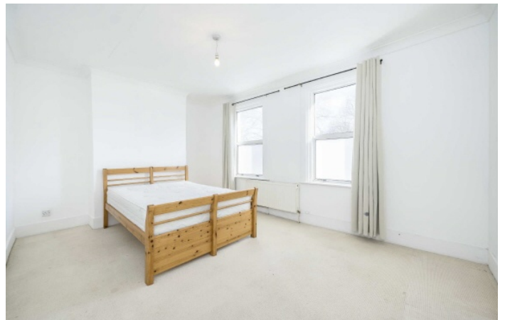
Dennett's Road, SE14