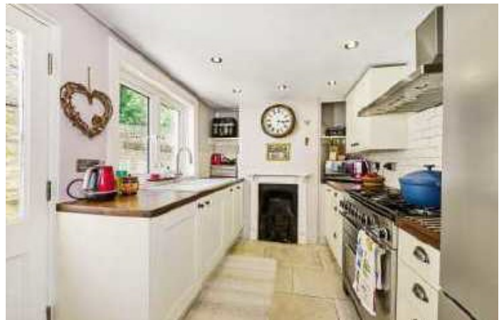
Dacre Park, SE13