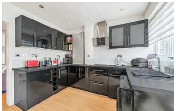
Sunnydale Road, SE12