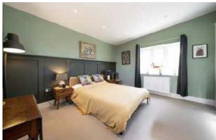
Court Mews, SE13