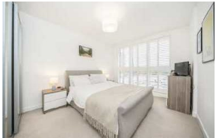
Ottley Drive, SE3