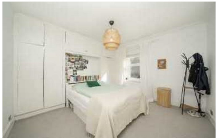
Lenham Road, SE12