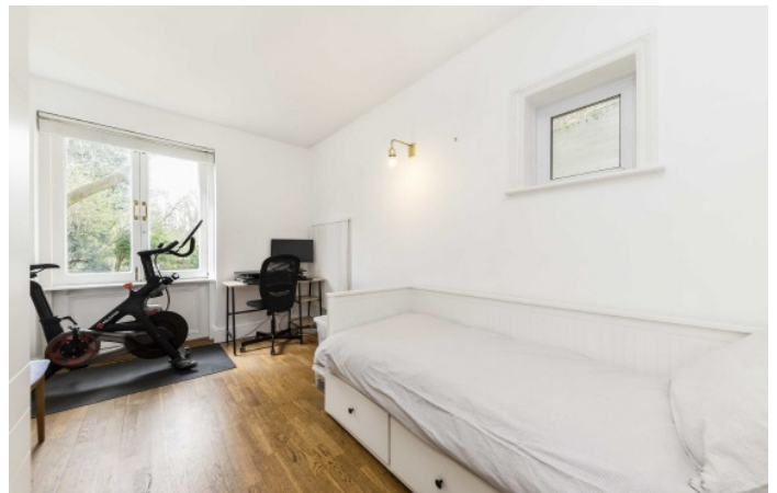
Manor Park, SE13