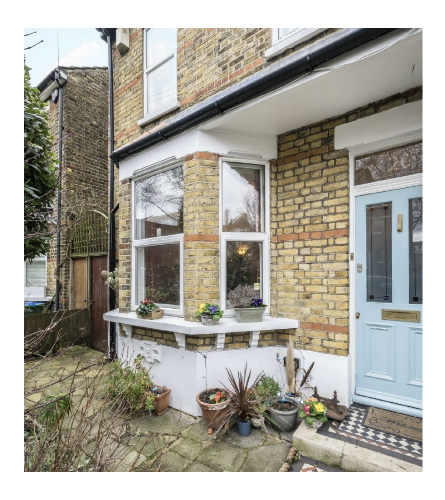
Meadowcourt Road, SE3 £900,000