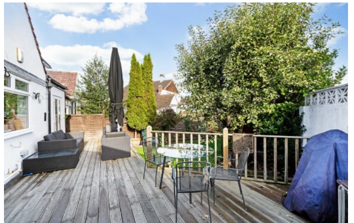
Pragnell Road, SE12