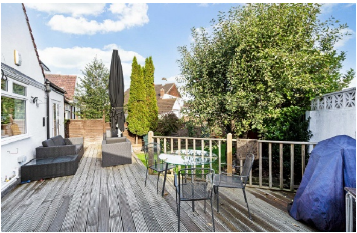
Pragnell Road, SE12