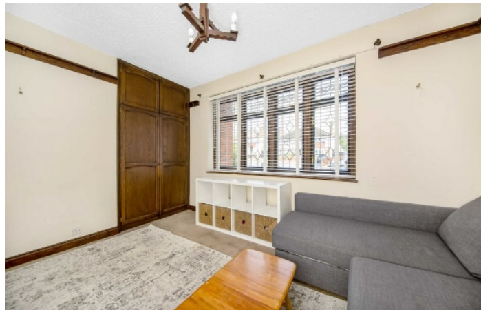
Winn Road, SE12