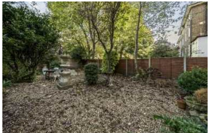
Shooters Hill Road, SE3