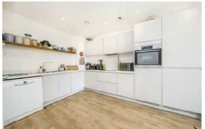
Artillery Place, SE18