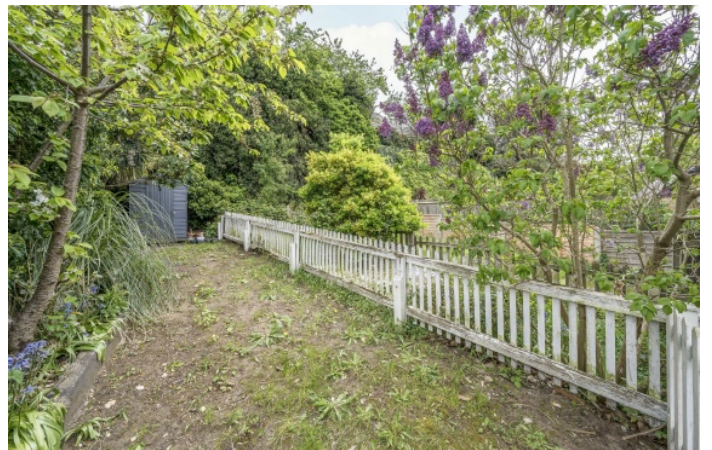
Wyndcliff Road, SE7