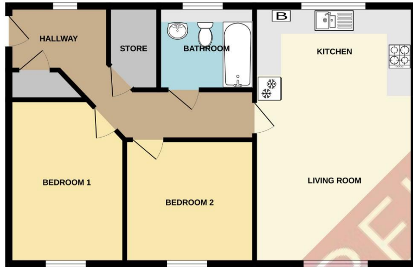
FIRST FLOOR 704 sq.ft. (65.4 sq.m.) approx.