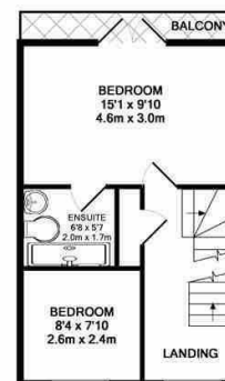
1ST FLOOR APPROX. FLOOR AREA 352 SQ. FT. (32.7 SQ. M.)