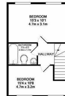
2ND FLOOR APPROX. FLOOR AREA 359 SQ. FT. (33.3 SQ. M.)

TOTAL APPROX. FLOOR AREA 1197 SQ. FT. (111.2 SQ. M.) Whilst every attempt has been made to ensure the accuracy of the floor plan contained here, measurements of doors, windows, rooms and any other items are approximate and no responsibility is taken for any error, omission, or mis-statement. This plan is for illustrative purposes only and should be used as such by any prospective purchaser. The services, systems and appliances shown have not been tested and no guarantee as to their operability or efficiency can be given. Made with Metropix ©2015