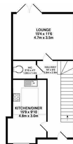
GROUND FLOOR APPROX. FLOOR AREA 487 SQ. FT. (45.2 SQ. M.)