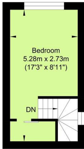
Third Floor Approximate Floor Area 155.10 sq ft (14.41 sq m)