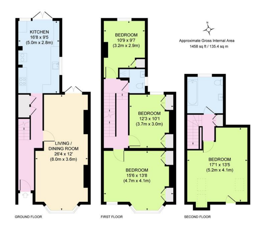
This plan for layout guidance only . Not drawn to scale unless stated. Whilst every care is taken in the preparation of this plan, pleas check all dimensions, shapes and compass before making any decisions upon them.