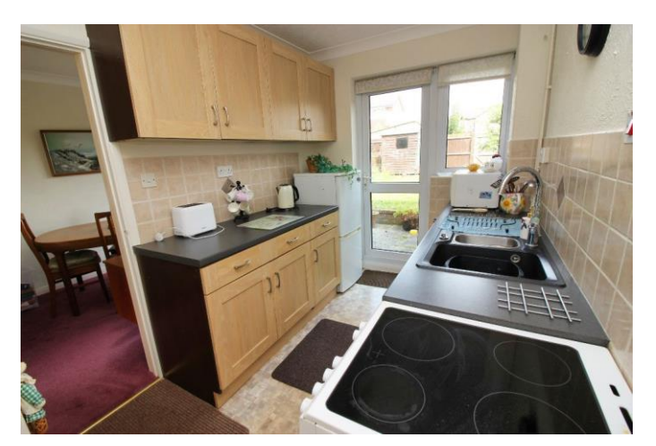
A 2 bedroom terraced home found in an incredibly convenient location with Allington.

The home is set back some way from the road having a good sized front garden. Entry into the home is via a Hallway that has space for hanging coats and shoes. The large Lounge/Diner is a bright and airy room have large windows to both front and rear aspects. Being open plan makes the room an ideal space for entertaining. The Kitchen has been modernized in recent years and has plenty of cupboards and work top space.