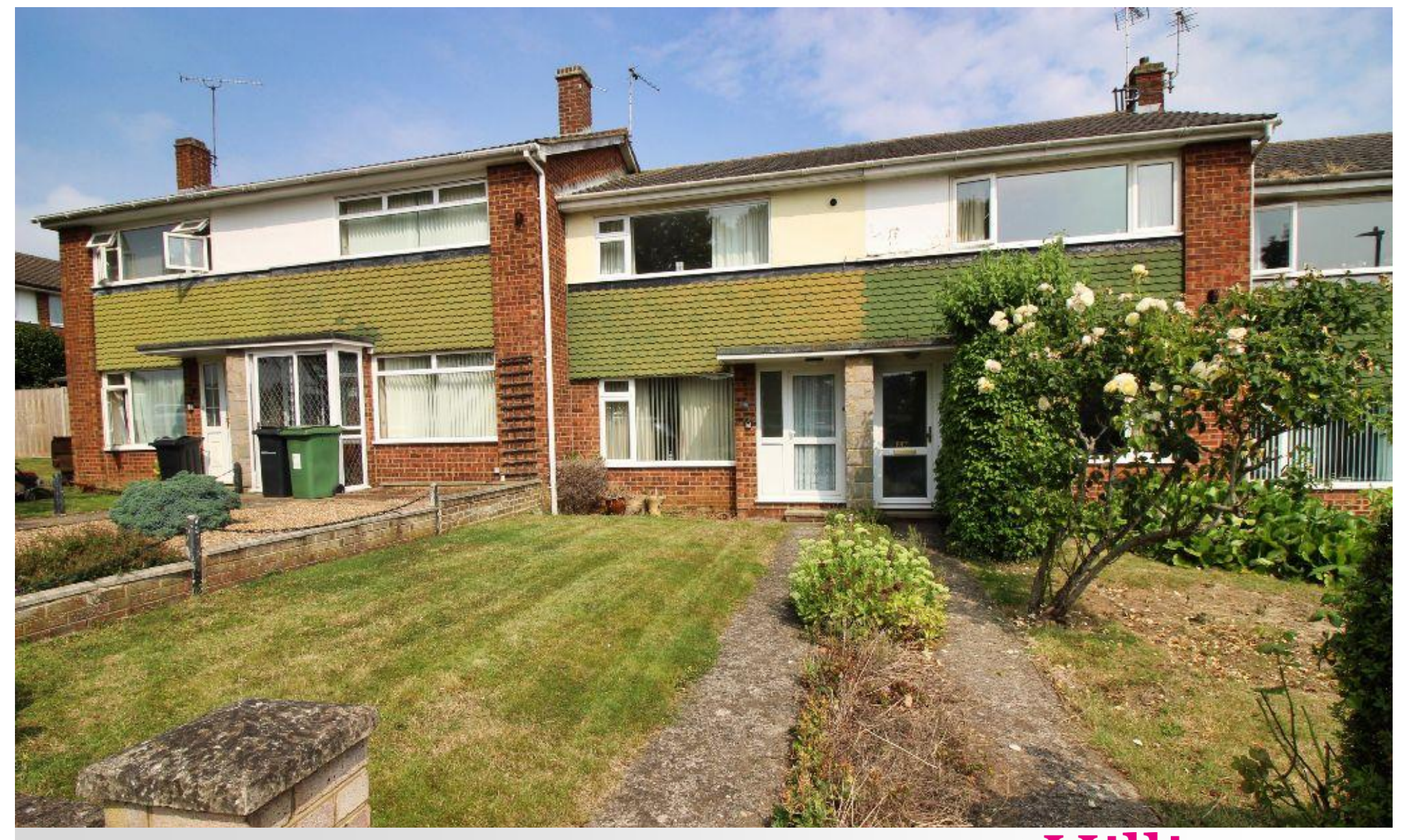
95 NEWBURY AVENUE, ALLINGTON, MAIDSTONE, KENT, ME16 ORE

01732 884422 enquiries@hillier-reynolds.co.uk www.hillier-reynolds.co.uk