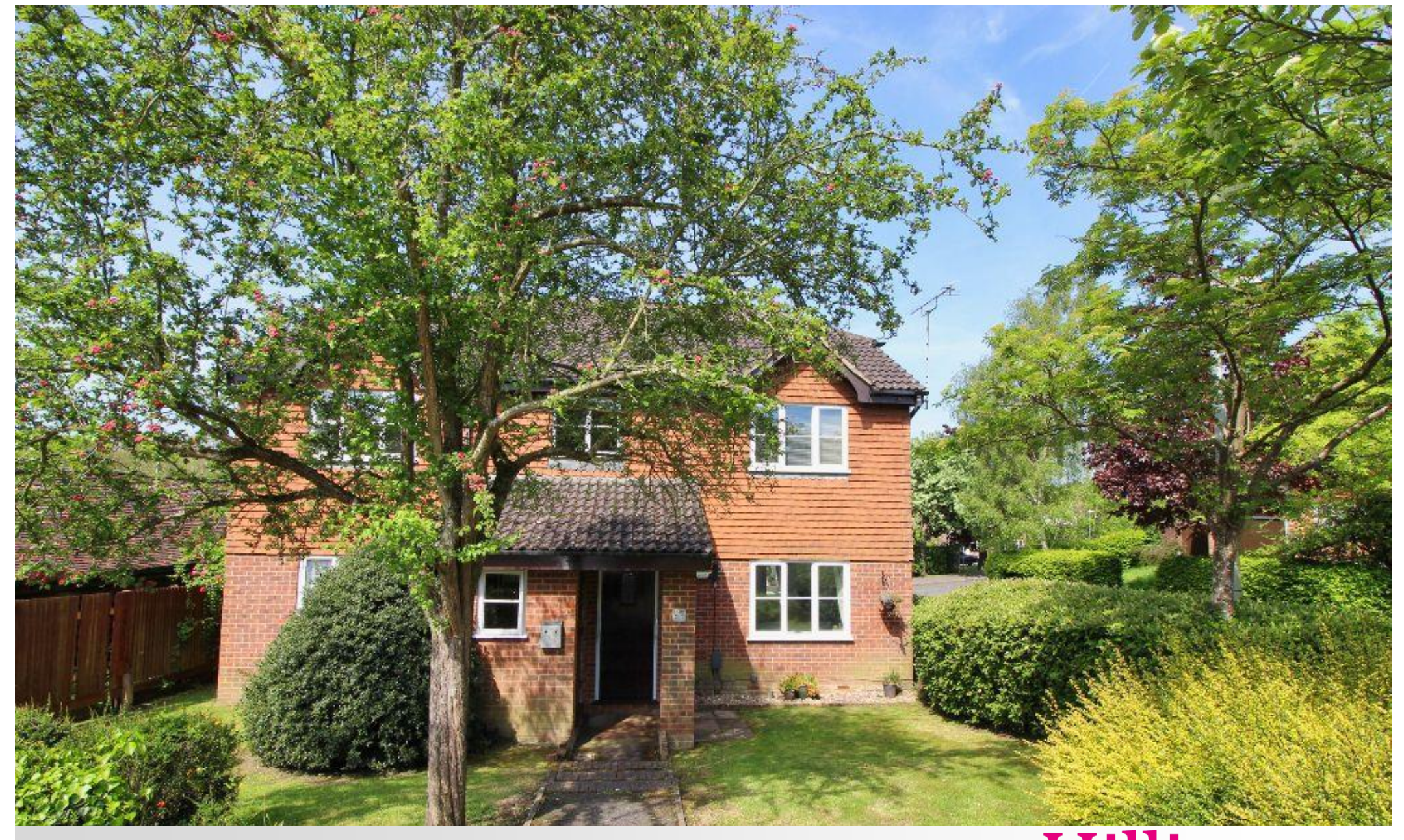
4 HUNTS FARM CLOSE, BOROUGH GREEN, KENT, TN15 8HY