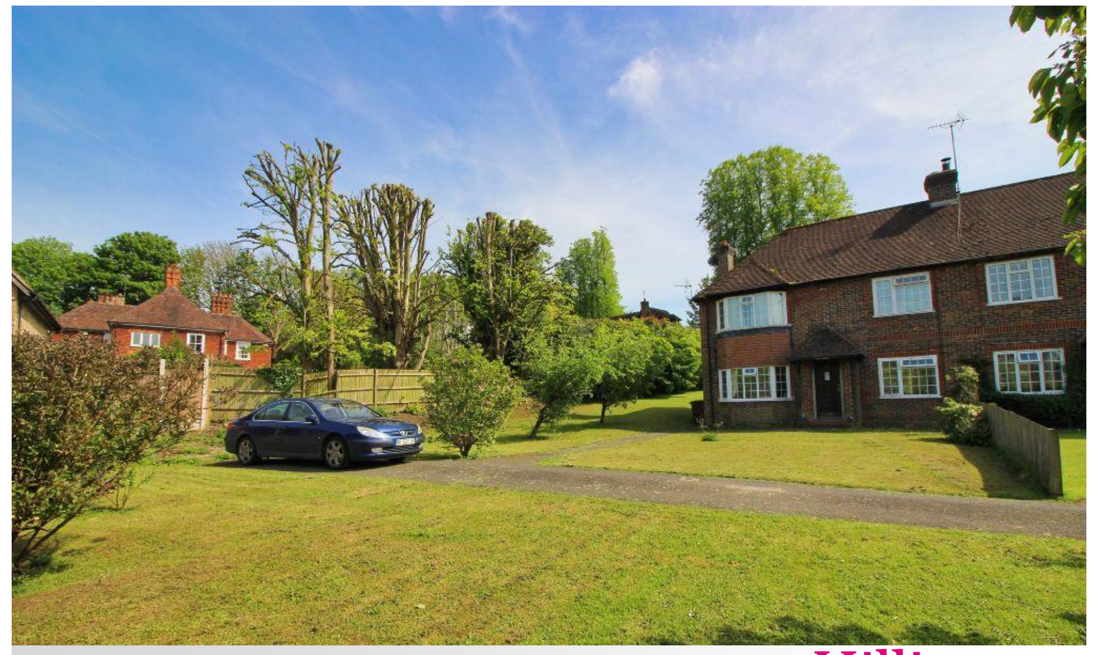
SINGLE WELL, JUBILEE CRESCENT, IGHTHAM, KENT, TN15 9AE