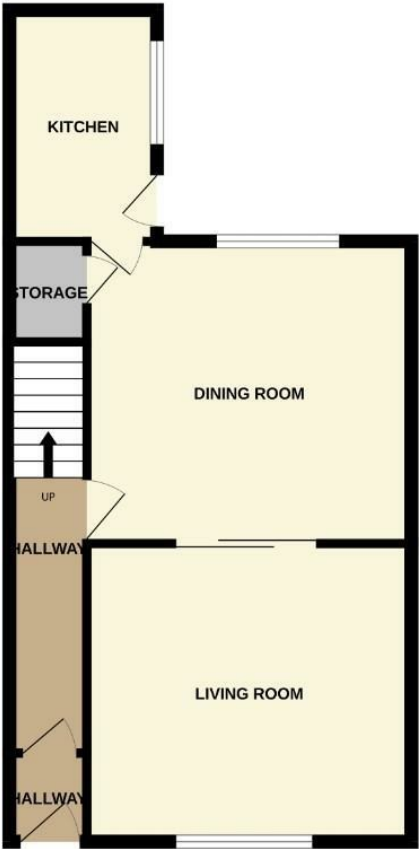
GROUND FLOOR 492 sq.ft. (45.7 sq.m.) approx.