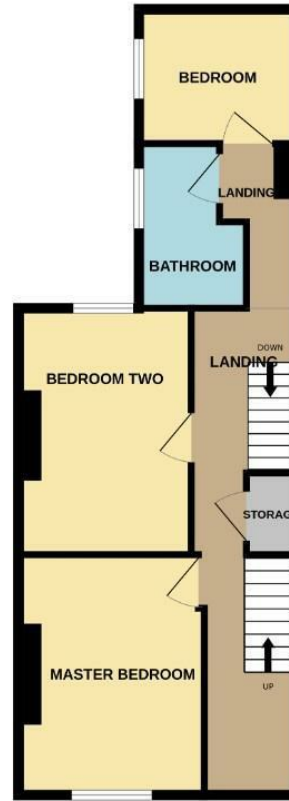
1ST FLOOR 563 sq.ft. (52.3 sq.m.) approx.