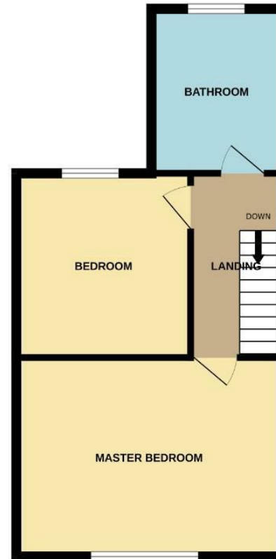
1ST FLOOR 416 sq.ft. (38.6 sq.m.) approx.