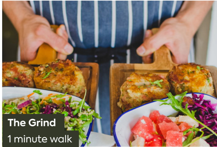
The Grind 1 minute walk