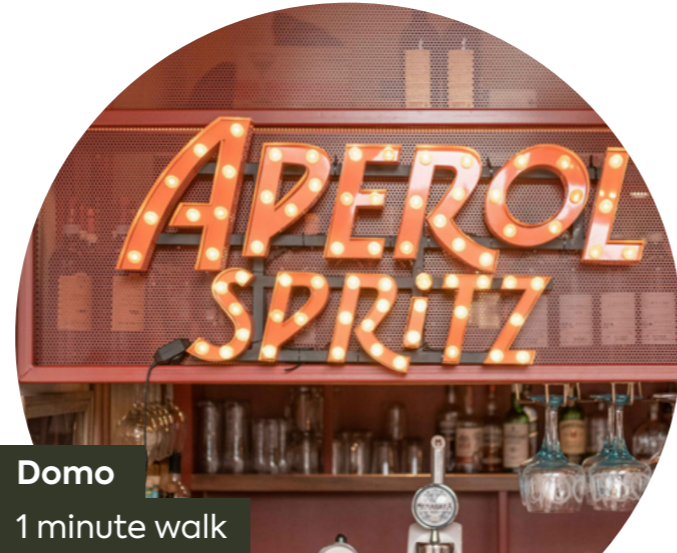
Domo 1 minute walk