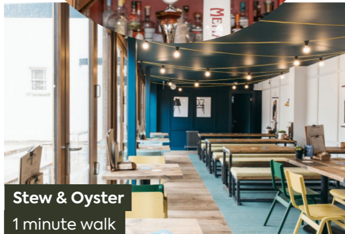
Stew & Oyster 1 minute walk