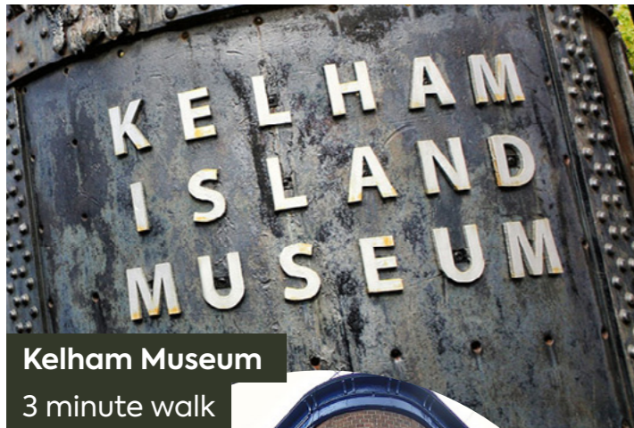
Kelham Museum 3 minute walk