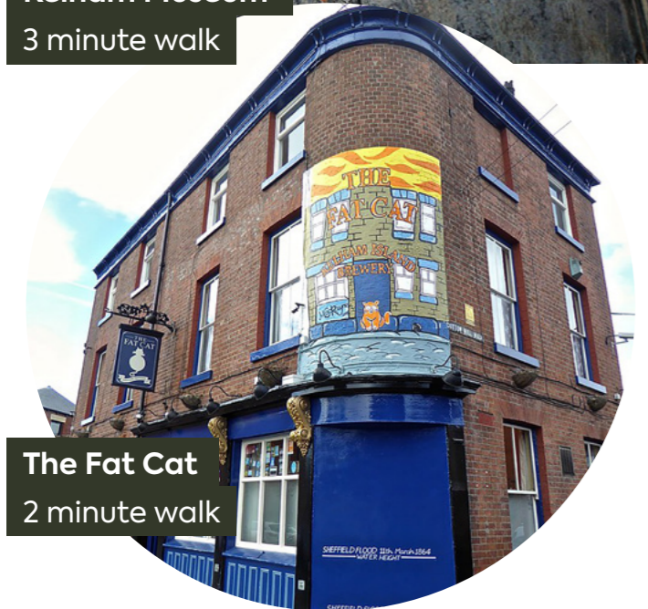
The Fat Cat 2 minute walk