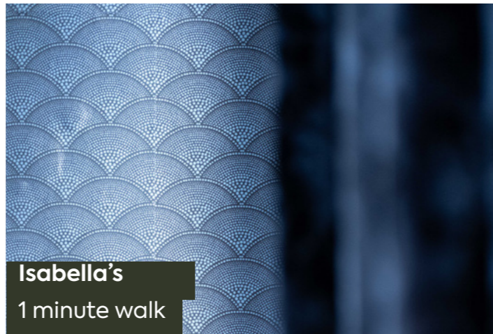
Isabella's 1 minute walk