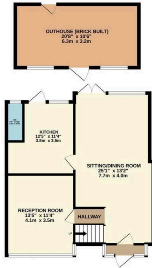
GROUND FLOOR 841 sq.ft. (78.1 sq.m.) approx.