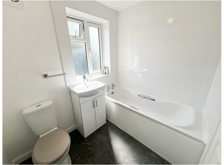
Bathroom 7'0" x 6'2" (2.14 x 1.88)