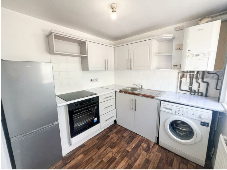
Kitchen 8'3" x 7'8" (2.53 x 2.34 )