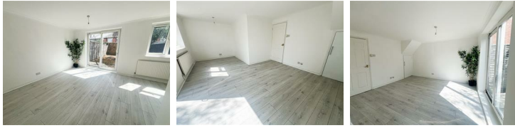
Reception 18'10" x 13'1" (5.76 x 4)