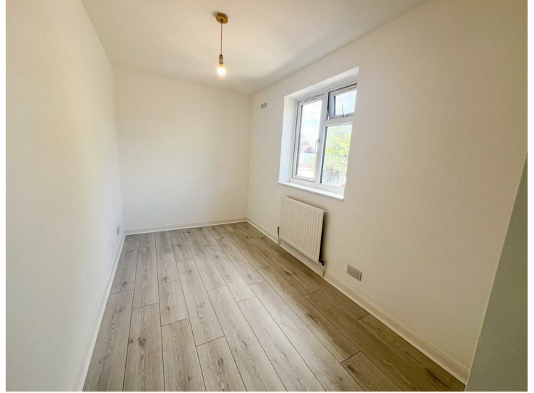
Bedroom 2 7'3" x 12'9" (2.21 x 3.9 )