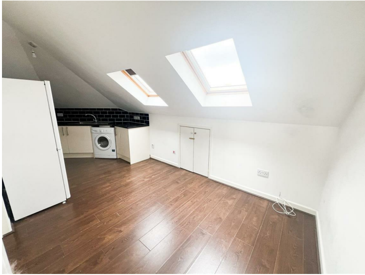
Kitchen/Diner 8'2" x 19'5" (2.51 x 5.93)