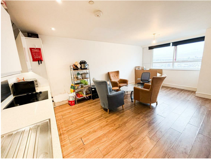
Reception Room 15'3" x 19'11" (4.67 x 6.08)