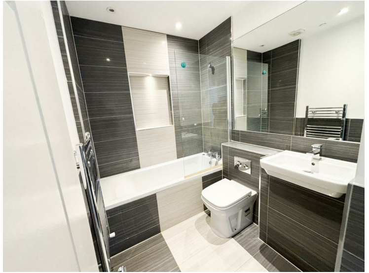
Bathroom 8'9" x 4'10" (2.69 x 1.49)