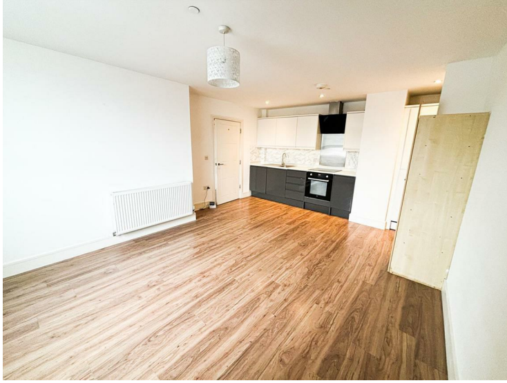
Reception Room/Kitchen 13'6" x 19'0" (4.14 x 5.81)