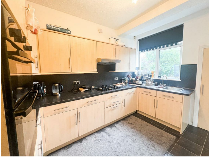
Kitchen 11'7 x 9'6 (3.53m x 2.90m)