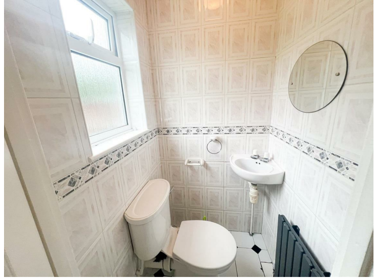
WC 3'6 x 3'6 (1.07m x 1.07m)