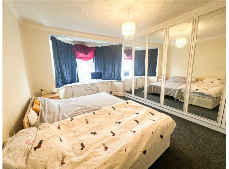
Bedroom 1 16'5 x 12'7 (5.00m x 3.84m)