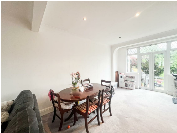
Lounge 32'5 x 12'11 (9.88m x 3.94m)