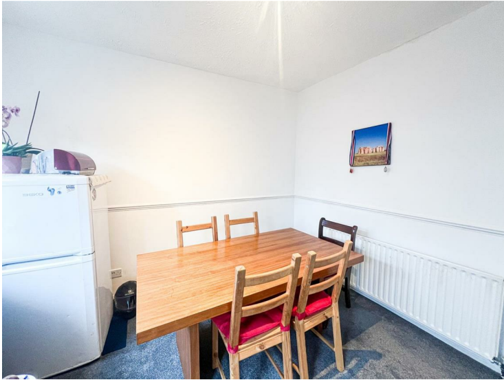
Dining Room 10'8 x 10'5 (3.25m x 3.18m)