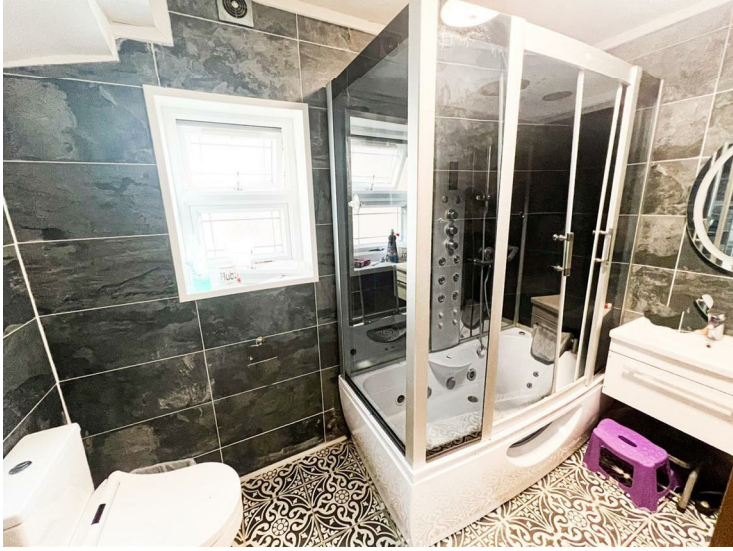
En Suite 2 4'6" x 6'5" (1.38 x 1.98)