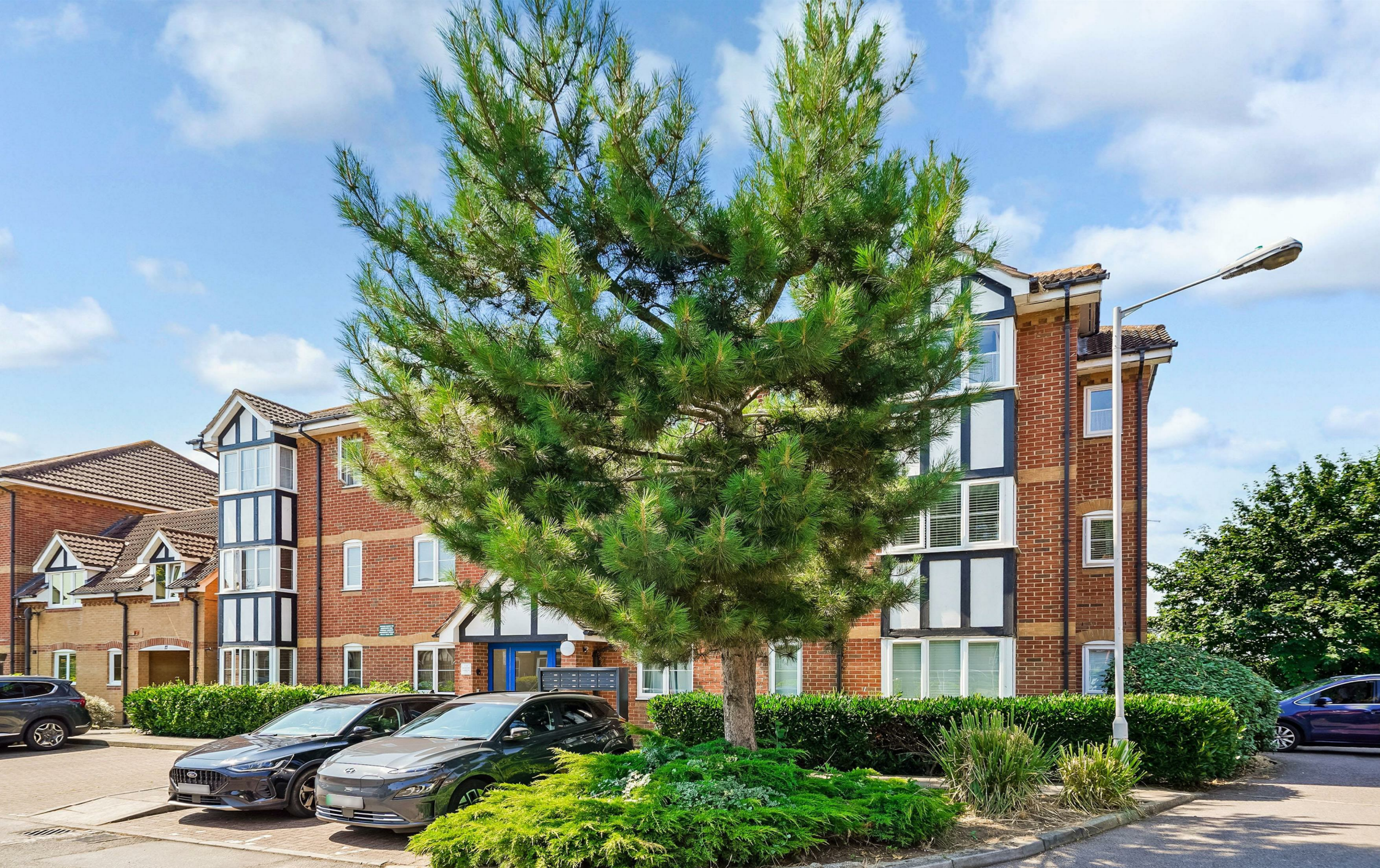
Redwood Gardens, Chingford, E4 7NZ