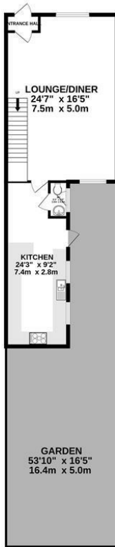
GROUND FLOOR 627 sq ft. (58.2 sq.m.) approx.