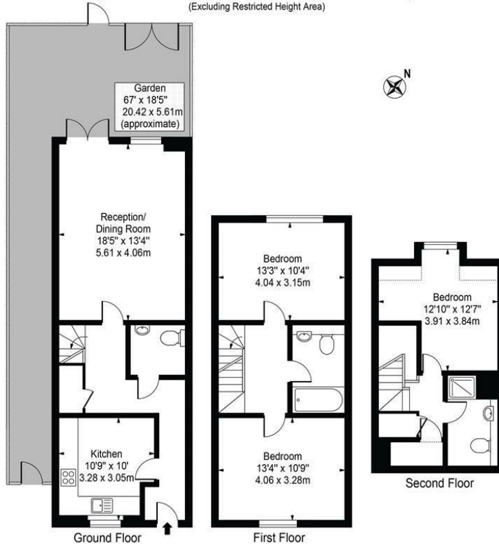
For Illustration Purposes Only - Not To Scale

Approx. Gross Internal Area 1170 Sq Ft - 108.70 Sq M (Excluding Restricted Height Area)