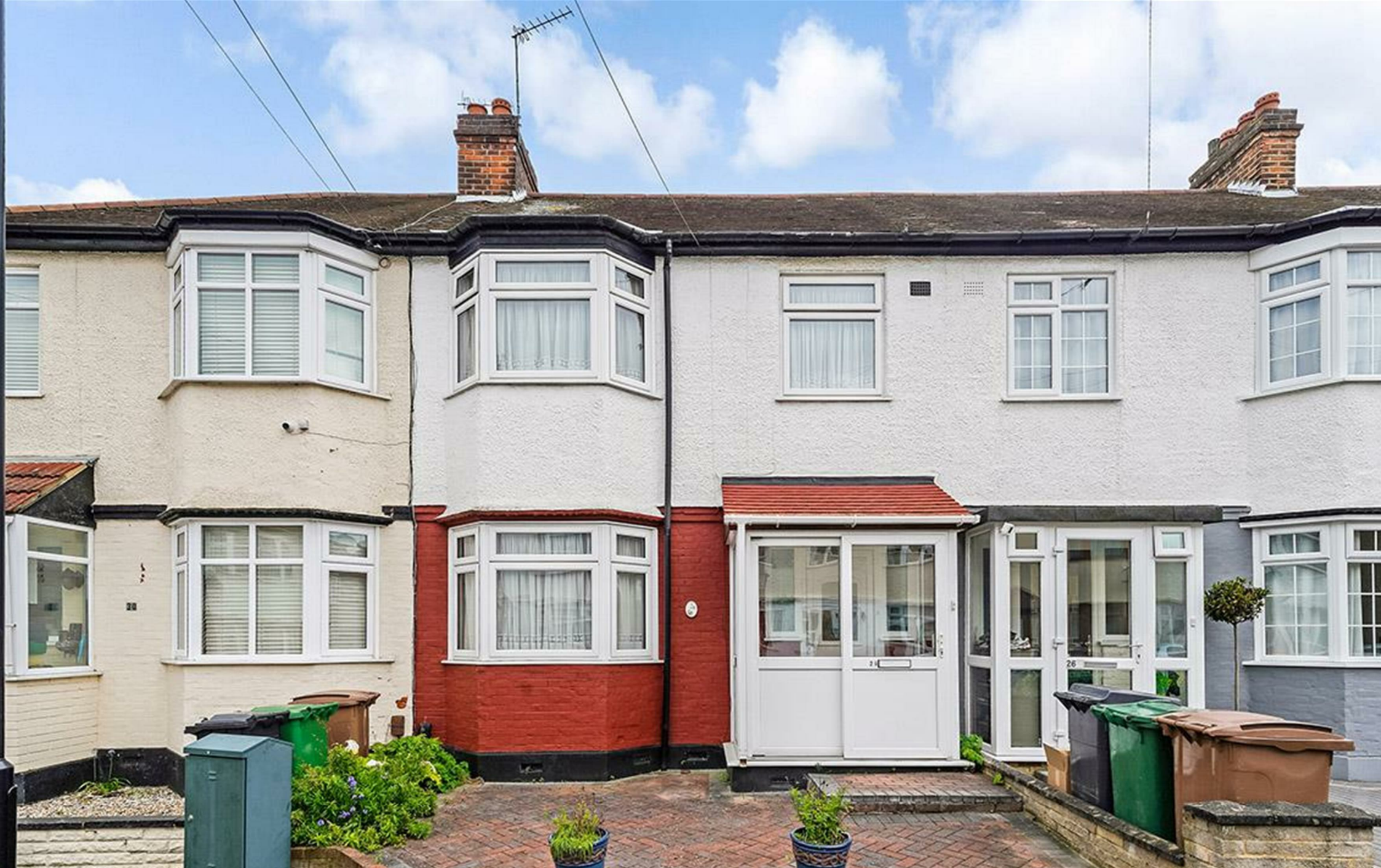
St. John's Road, Chingford, E4 9TB