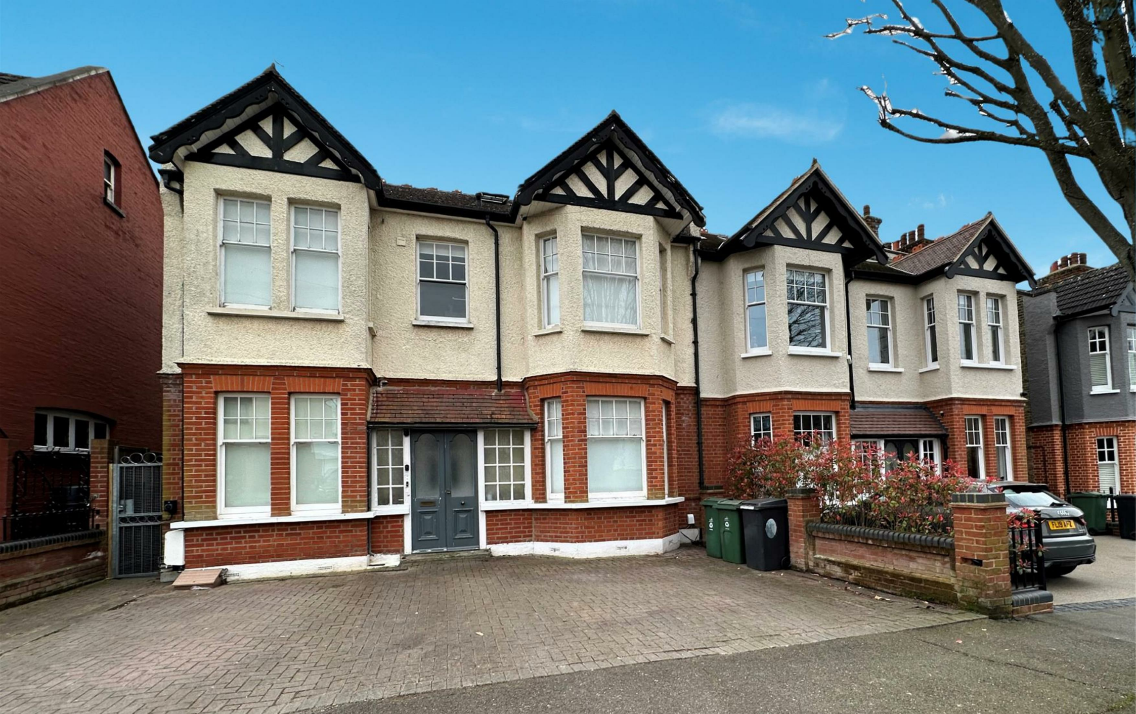
Victoria Road, North Chingford, E4 6BZ