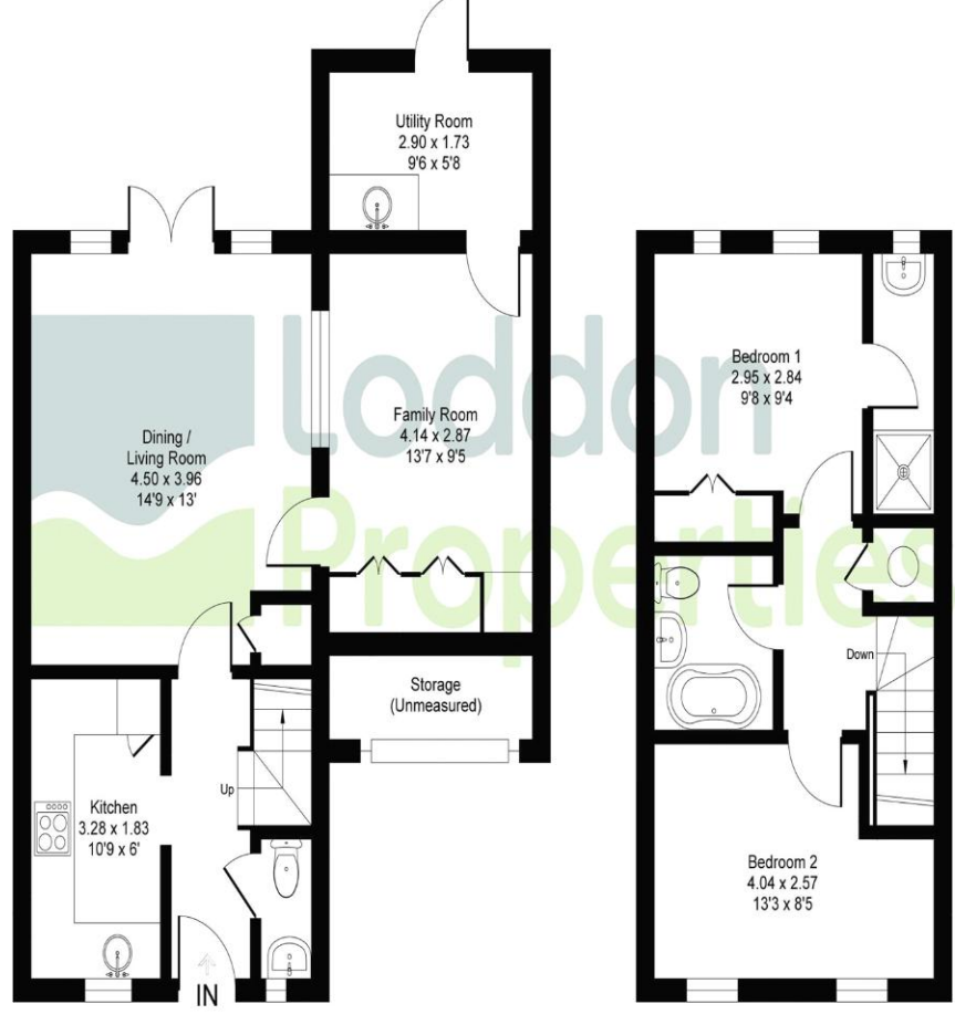
Ground Floor = 49.9 sqm / 538 sqft