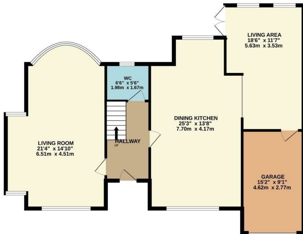
GROUND FLOOR 1067 sq.ft. (99.1 sq.m.) approx.