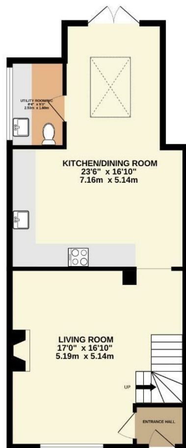
GROUND FLOOR 631 sq.ft. (58.6 sq.m.) approx.