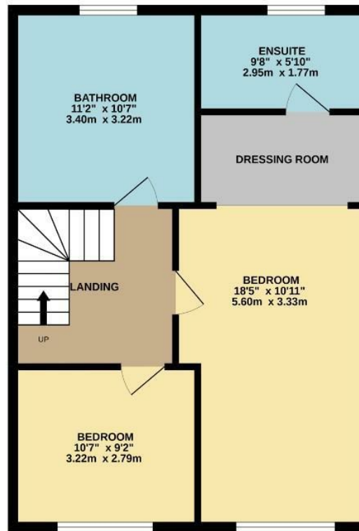
1ST FLOOR 598 sq.ft. (55.6 sq.m.) approx.