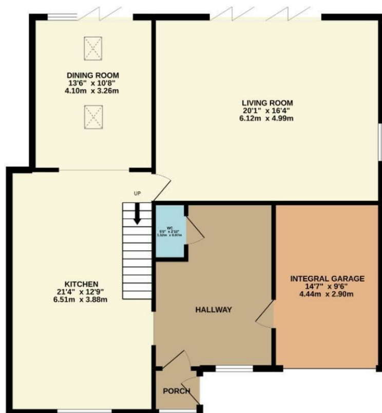
GROUND FLOOR 1053 sq.ft. (97.8 sq.m.) approx.