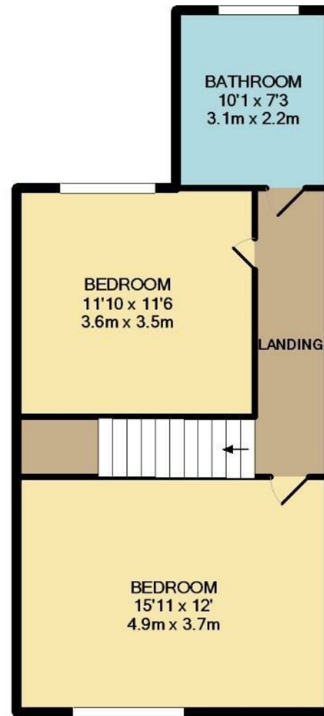
1ST FLOOR APPROX. FLOOR AREA 494 SQ.FT. (45.9 SQ.M.)

TOTAL APPROX. FLOOR AREA 989 SQ.FT. (91.9 SQ.M.)