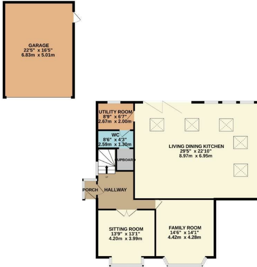
GROUND FLOOR 1666 sq.ft. (154.7 sq.m.) approx.